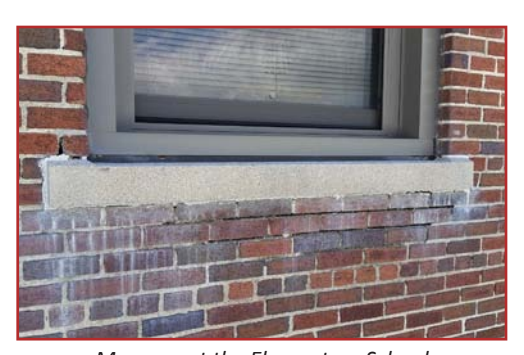
Masonry at the Elementary School in need of repointing.