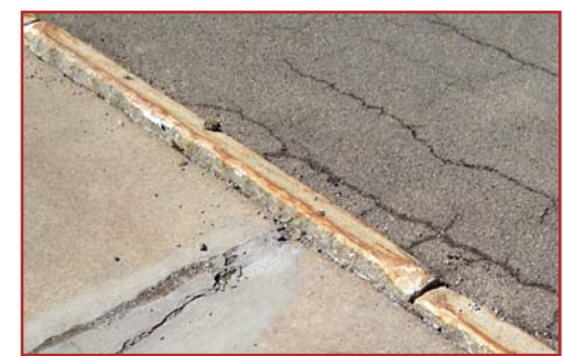
Sidewalks, curbs, and pavement at the Junior/ Senior High School in need of replacement.