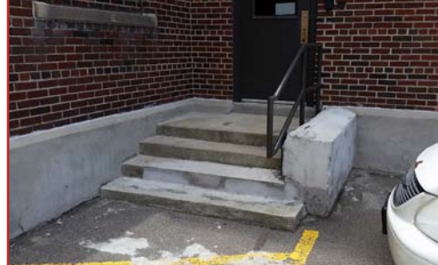
Stairs and entrances doors at the Elementary School in need of repair.