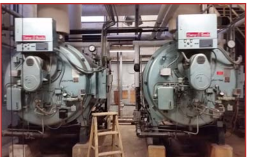
Elementary School boilers in need of replacement.