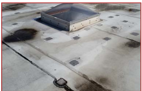
Roofs at the Junior/Senior High School in need of replacement.