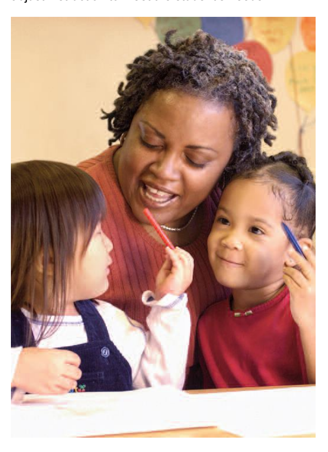
How often does progress monitoring occur?

Progress monitoring involves a frequent assessment of a student's performance in specific skill areas. Progress monitoring is used to determine whether the specific instructional support is working and to provide information to the student's teacher on how to adjust instruction to meet the student's needs.